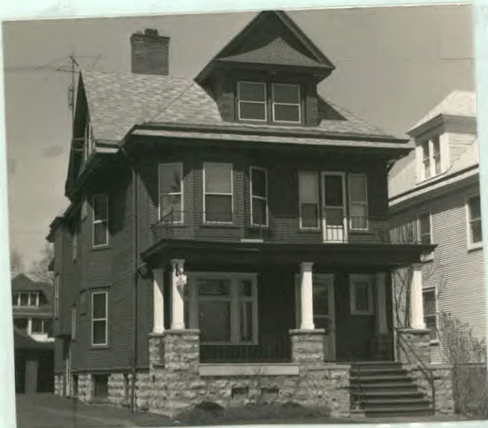
12. PHOTO: 28-36a