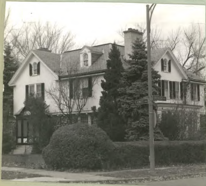
12. PHOTO: 18-20a