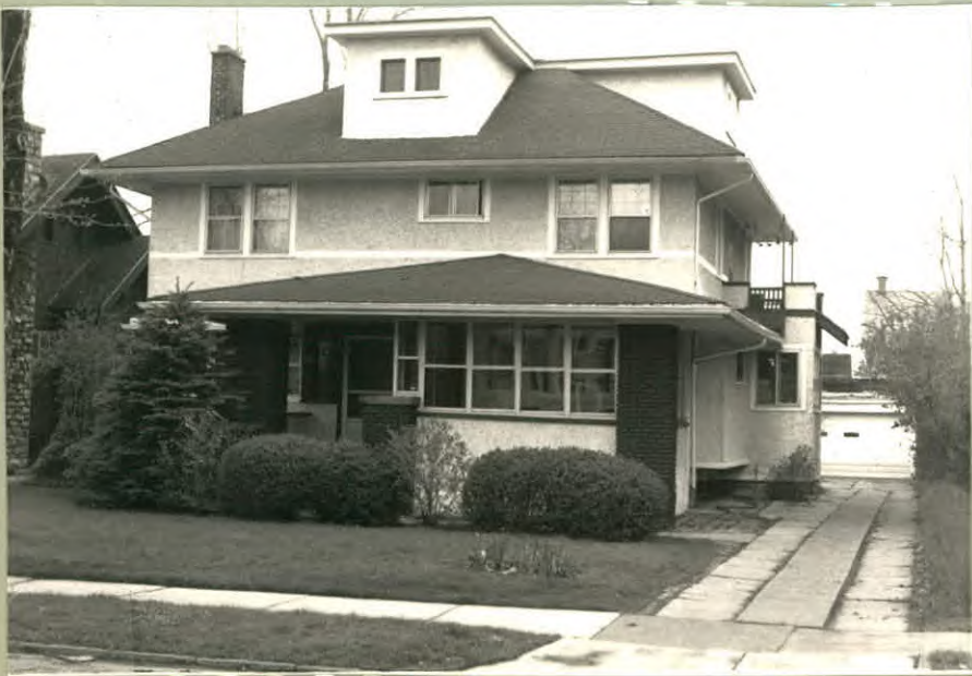
12. PHOTO: 40-31a