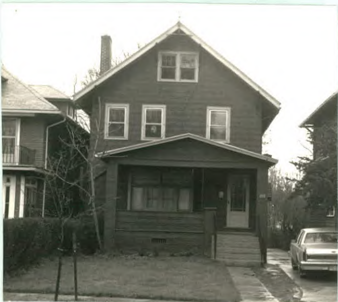
12. PHOTO: 37-32a