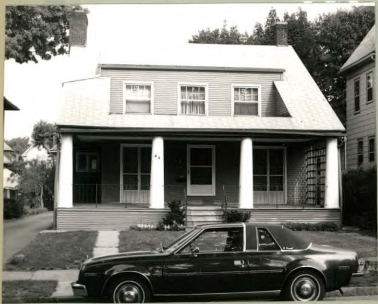
12. PHOTO: 9-23a