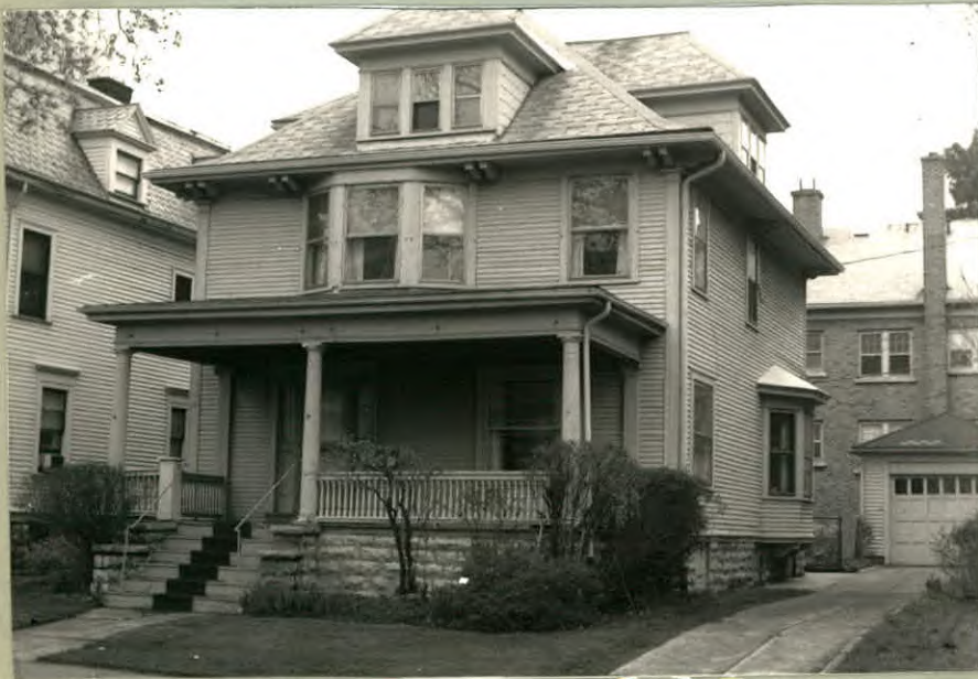
12. PHOTO: 41-26a