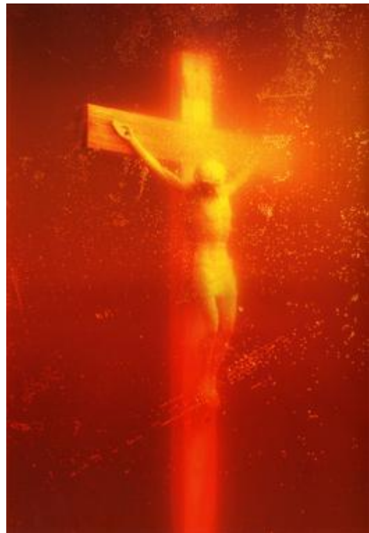
Figure 1 Piss Christ Andres Serrano (1987)

The controversy that sparked a "Culture War" against the NEA and what artists were funded was a centered on the artist Andres Serrano and his work titled Piss Christ . (Figure 1) Serrano was a photographer working mainly out of New York. He was born in 1950 in New York City, an only child of a Honduran immigrant father and Afro-Cuban