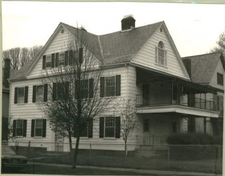
12. PHOTO: 39-9a