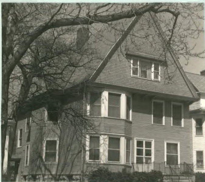
12. PHOTO: 28-30a