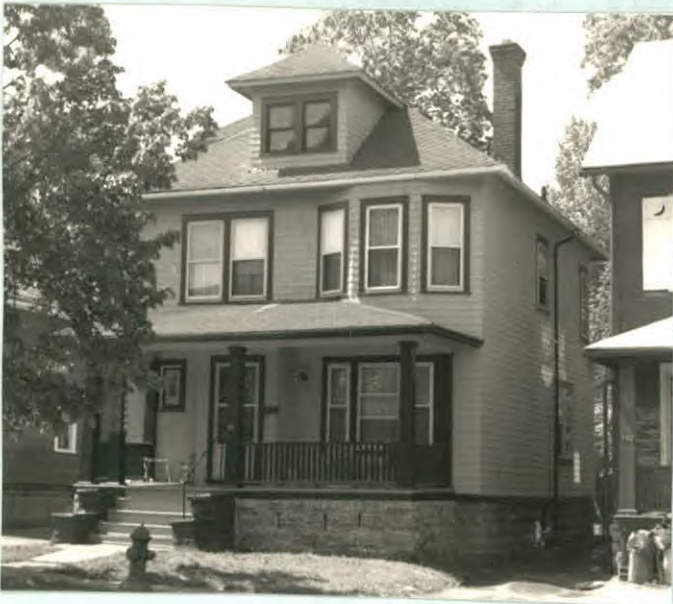
12. PHOTO: 42-35a