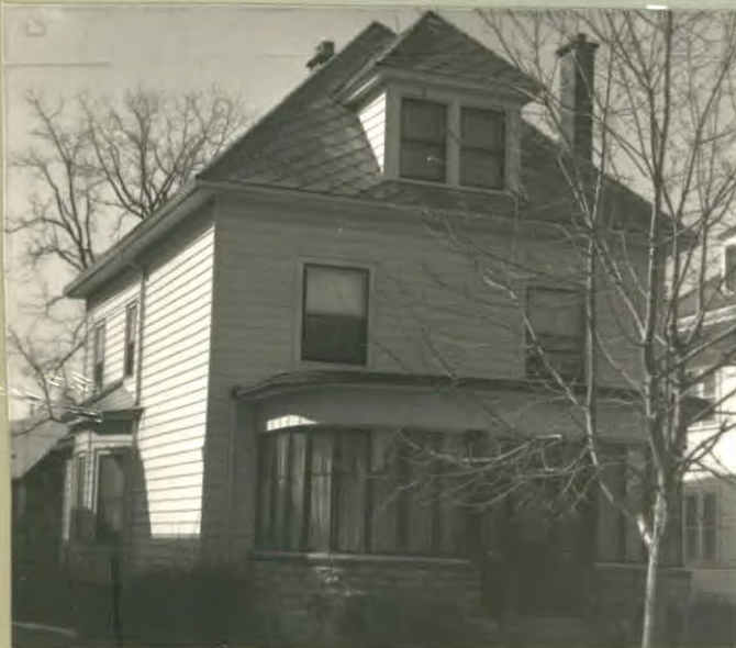
12. PHOTO: 27-7a