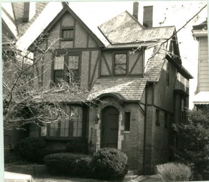
12. PHOTO: 41-34a