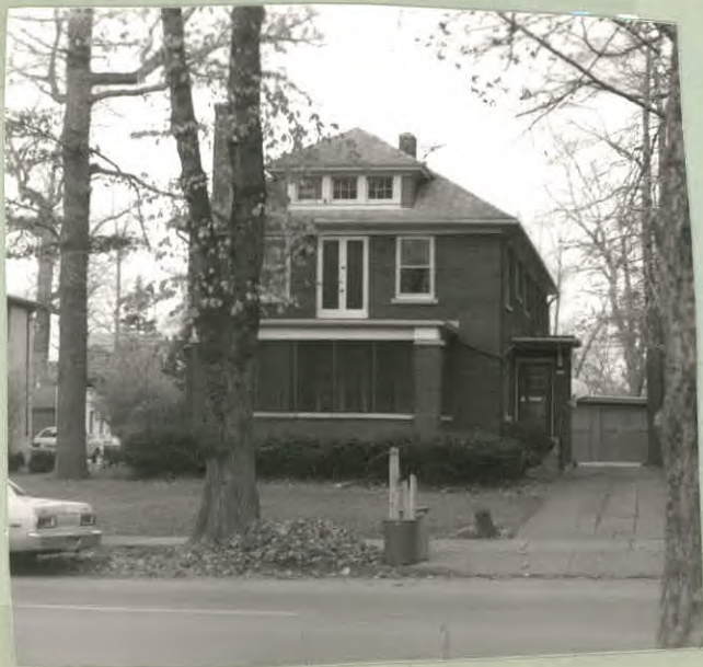
12. PHOTO: 17-5a