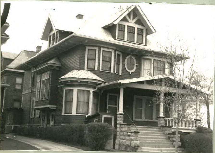
12. PHOTO: 41-20a