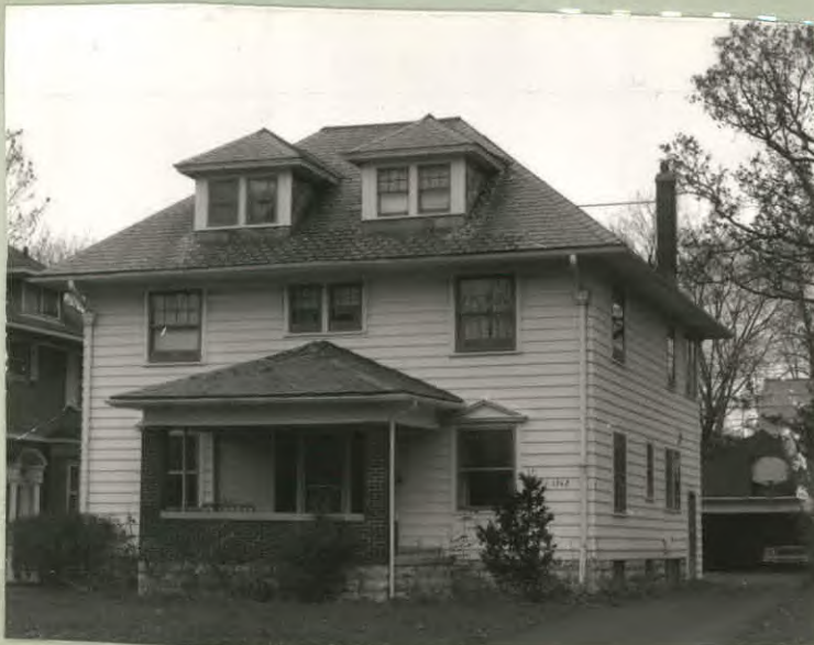
12. PHOTO: 11-36a