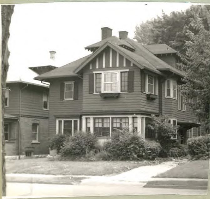
12. PHOTO: 12 8a