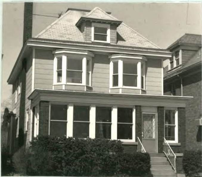
12. PHOTO: 28-22a