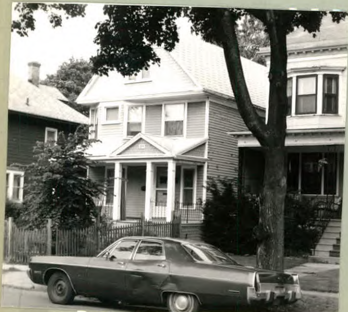
12. PHOTO: 9-29a