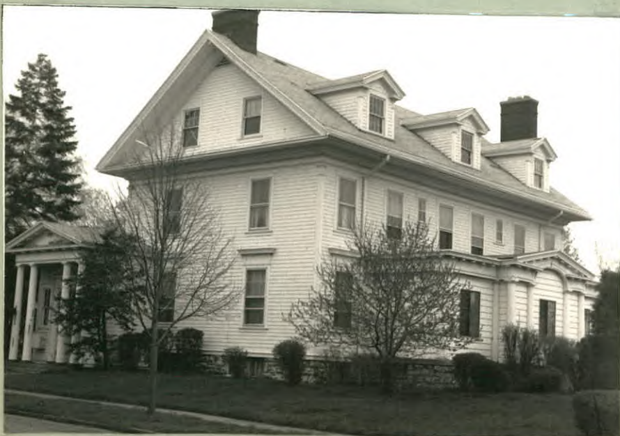
12. PHOTO: 41-17a