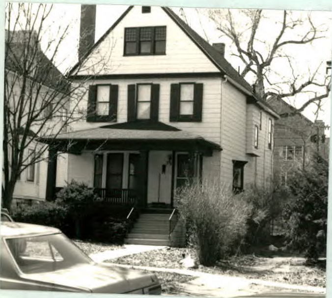
12. PHOTO: 31-1