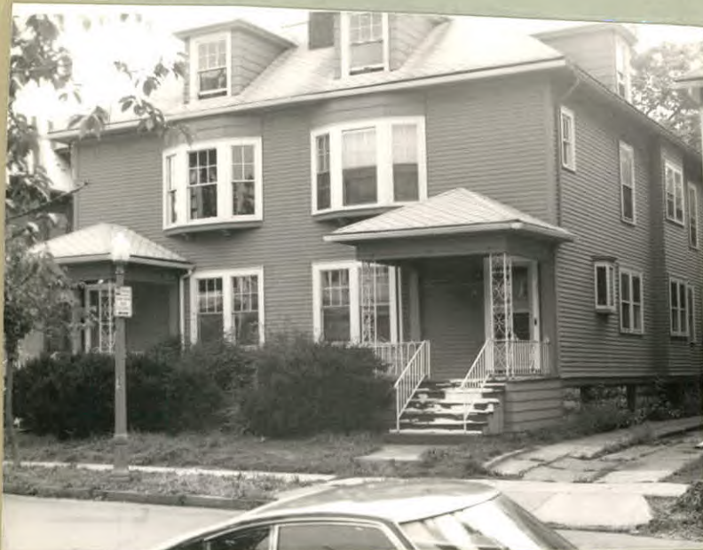
12. PHOTO: 9-35a