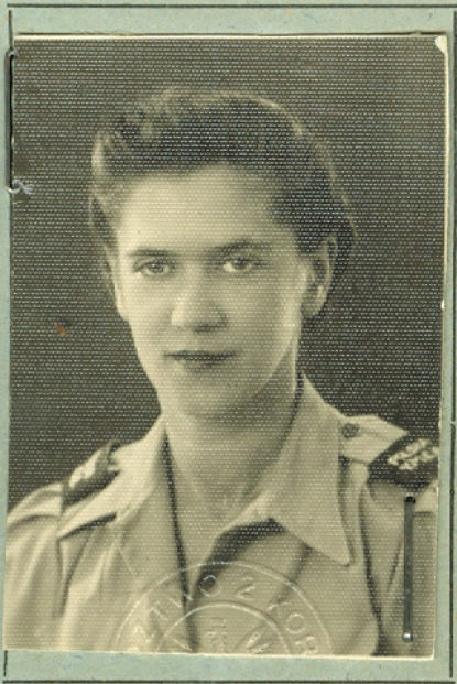
UNIT STAMP Pieczęć

SIGNATURE OF HOLDER Podpis Własciciela Legitymacji