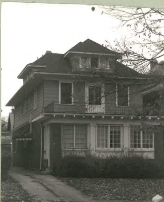
12. PHOTO: 18-7a