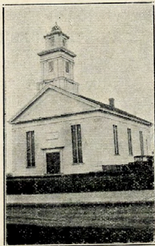
The Dickersonville Church as it is today.