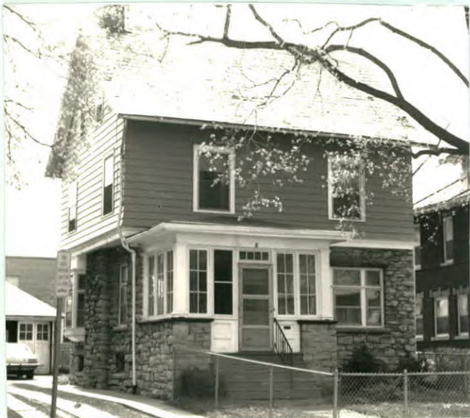
12. PHOTO: 34-34a