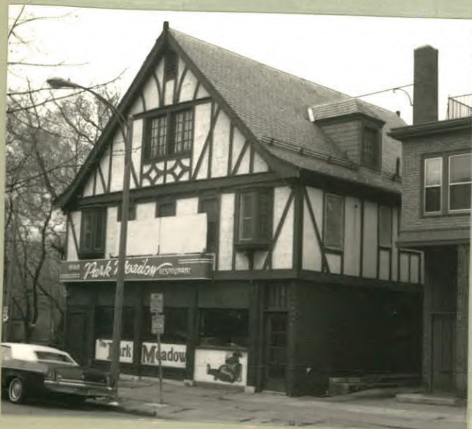
12. PHOTO: 39-17a