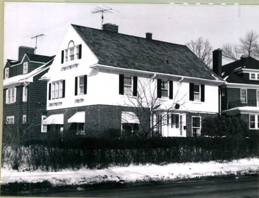
12. PHOTO: 20-2a