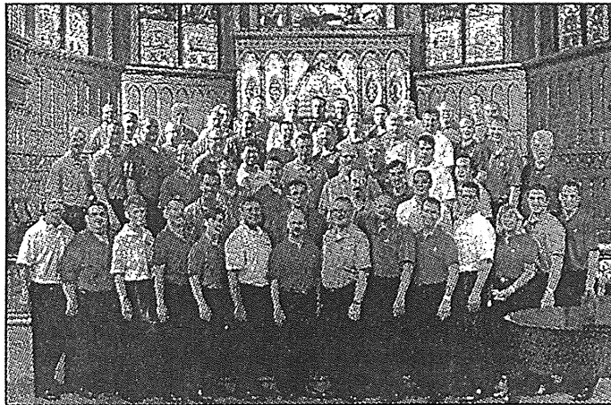
BGMC filled two halls at our June concerts.