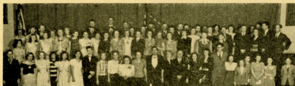
Youth in the Church

A wide variety of recreational facilities and events are open and available for interested persons of all ages.